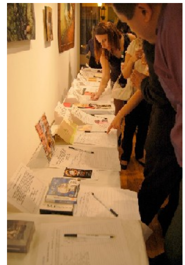
Guests bid for items.