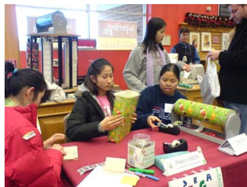
Students gift wrapping at Borders.

If you are interested in gift wrapping with us this year, please email us to find out which shifts are still in need of volunteers!