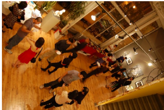
Guests at the Fall Soiree & Silent Auction at 4Art, Inc.

guests and generous donors who made the night such a great success!