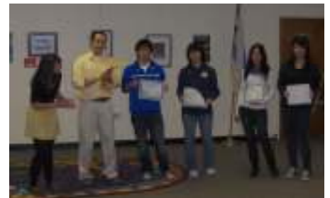
Students receive recognition certificates.