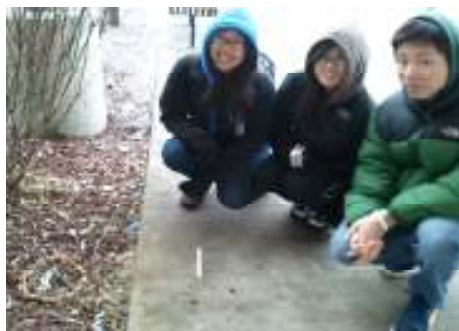
Students out on a photo shoot.

As the final project, students utilized Photovoice, a methodology that employs photography to educate and spark discussion in the community about social issues. Over the semester, students worked together to capture images of tobacco use in the community, with the goal of conveying an anti-tobacco message. Students also worked in teams to edit and create captions for the photos.