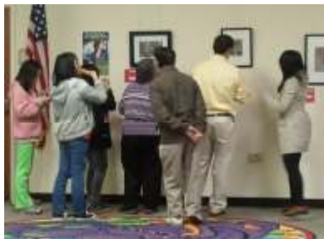
Guests browsing photos.

On Saturday afternoon over fifty library patrons, young and old, visited the gallery. The photos sparked discussion about smoking, and some told personal stories of how they were personally affected by tobacco smoking.